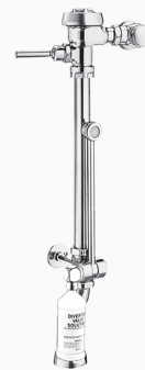
Variation Not Shown: Double Wall